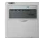
optional wired thermostat