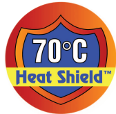
* Heat Shield