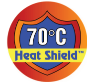
* Heat Shield