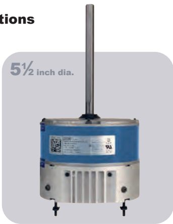
5 1/2 inch dia.