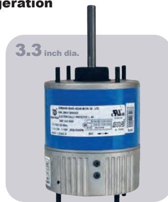
3.3 inch dia.